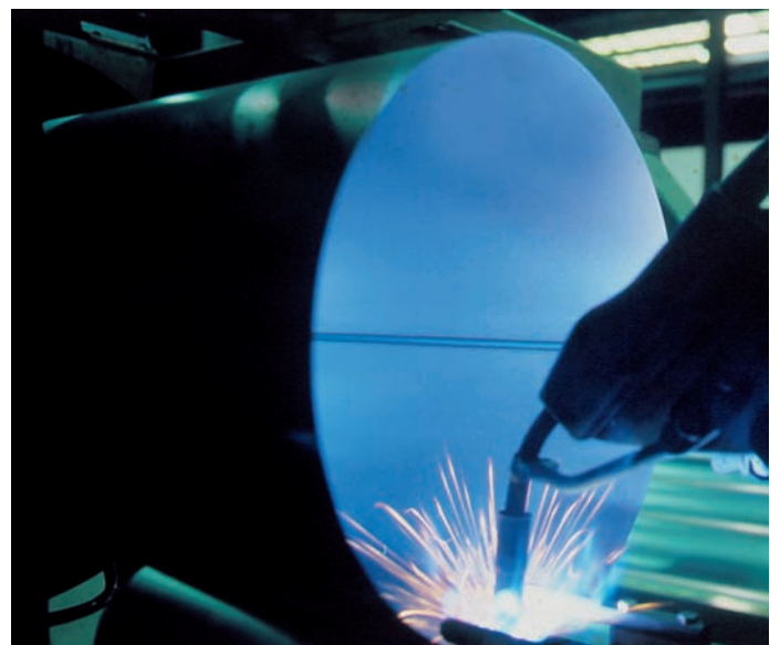
Solahart tank production technology is fully automated.

The Solahart product range has evolved over more than fifty years, and like any progressive industry, the company is always seeking to improve the product. At any point in those fifty years, Solahart can make the claim that it was the innovator and the standard setter. Nothing has changed.